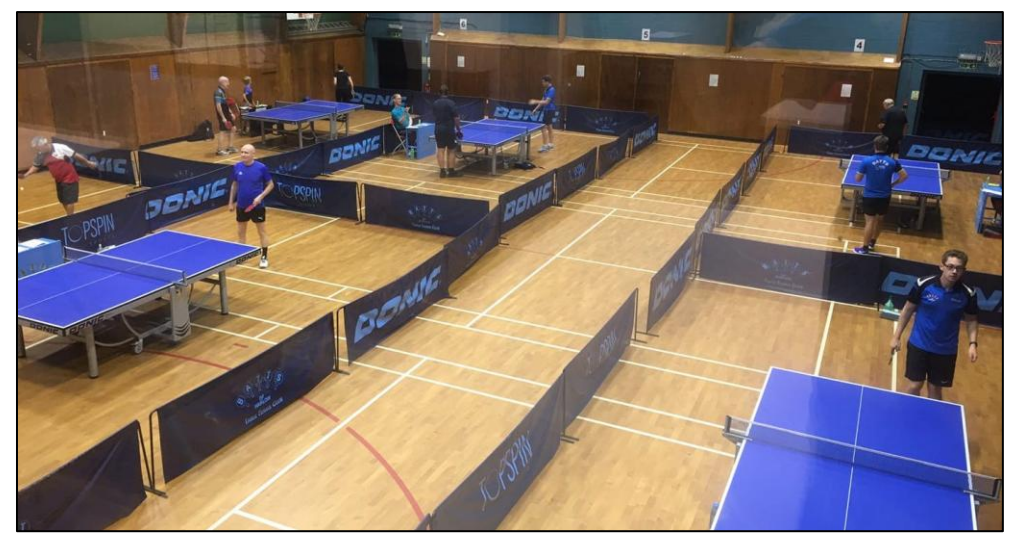
Open Singles returns on 22nd September 2020

About 75% of the players who'd registered in the latest Open Singles series confirmed they'd be interested to continue, and so we resumed on 22nd September giving the choice of Tuesday evening or Sunday afternoon for each of the remaining five rounds. The constraints on table layout and the popularity of the competition meant that we had to disappoint a few players, but those who missed registering for a round were given a guaranteed place in the following round. That seemed to placate those who were not quite quick enough to grab the 18 places on offer at each session.