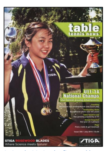
Table Tennis News Issue 1, October 1966 and Table Tennis News Issue 350, July 2010 - the first and last